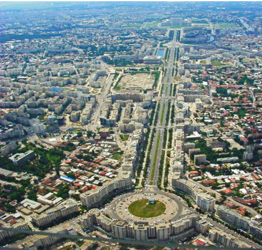
Unirii Boulevard - Palace of Parliament Bucharest