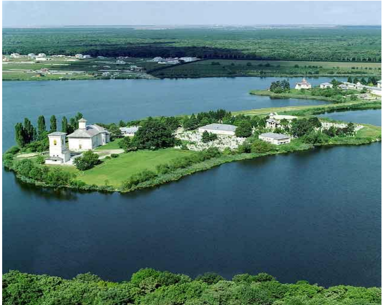
Cernica Monastery, Ilfov County

✓ Tourism - business, congress & exhibition, spa & wellness, museums, gardens and parks