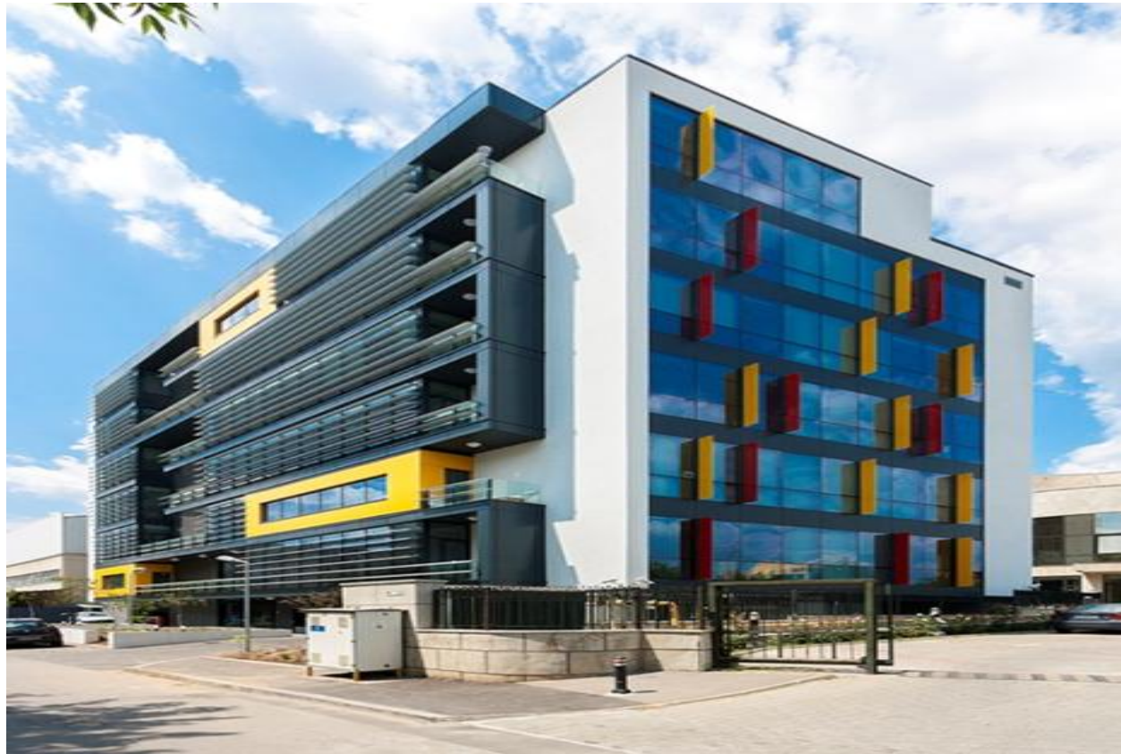
Siriului Business Centre, Bucharest, REGIO beneficiary