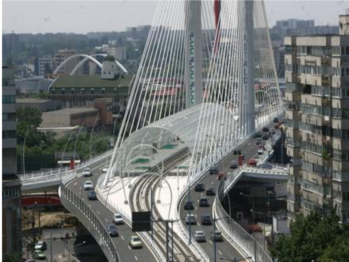
Bucharest Basarab Overpass

✓ Construction & real estate: industrial & retail structures, office spaces, business support centers, residential parks, entertainment centers & parks, especially in the North and West of Bucharest