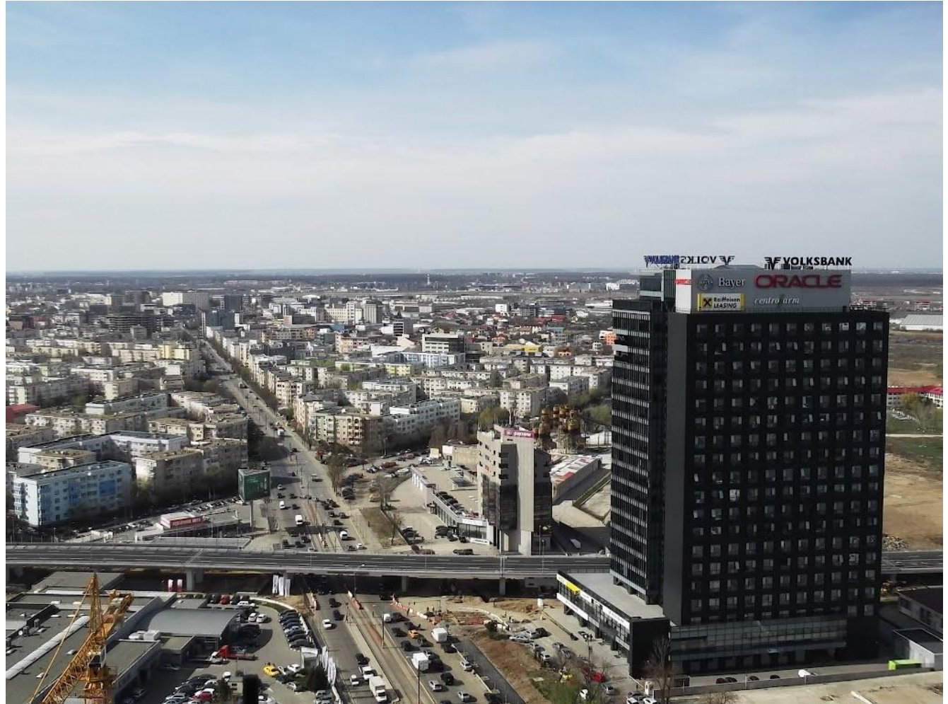
Oracle Headquarters, Bucharest

✓IT&C - support centers, technological parks, assembling facilities included