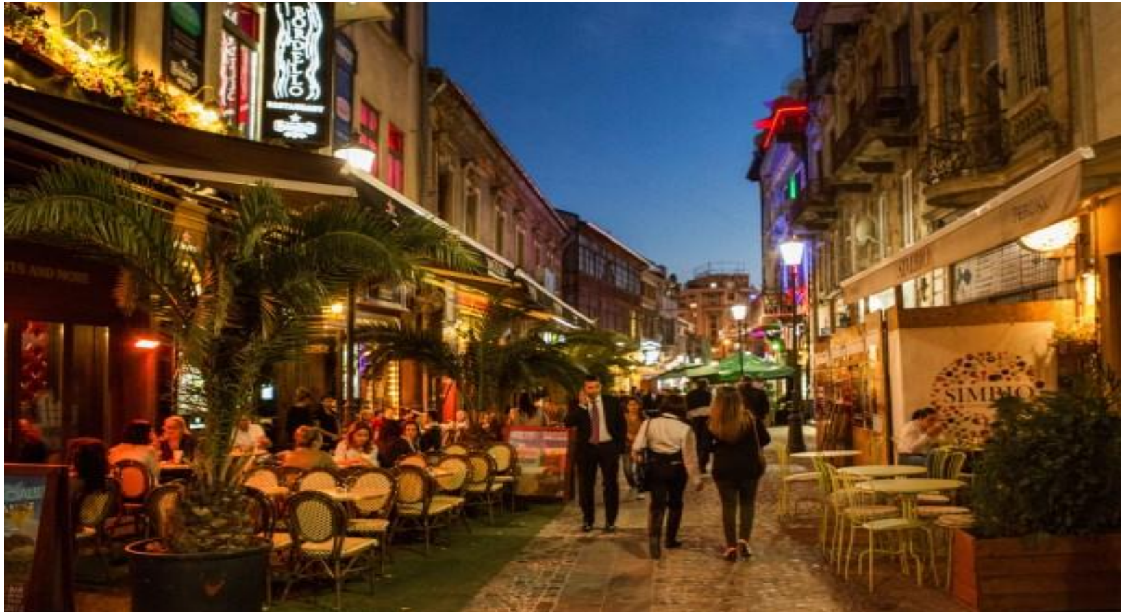
Old center, Bucharest