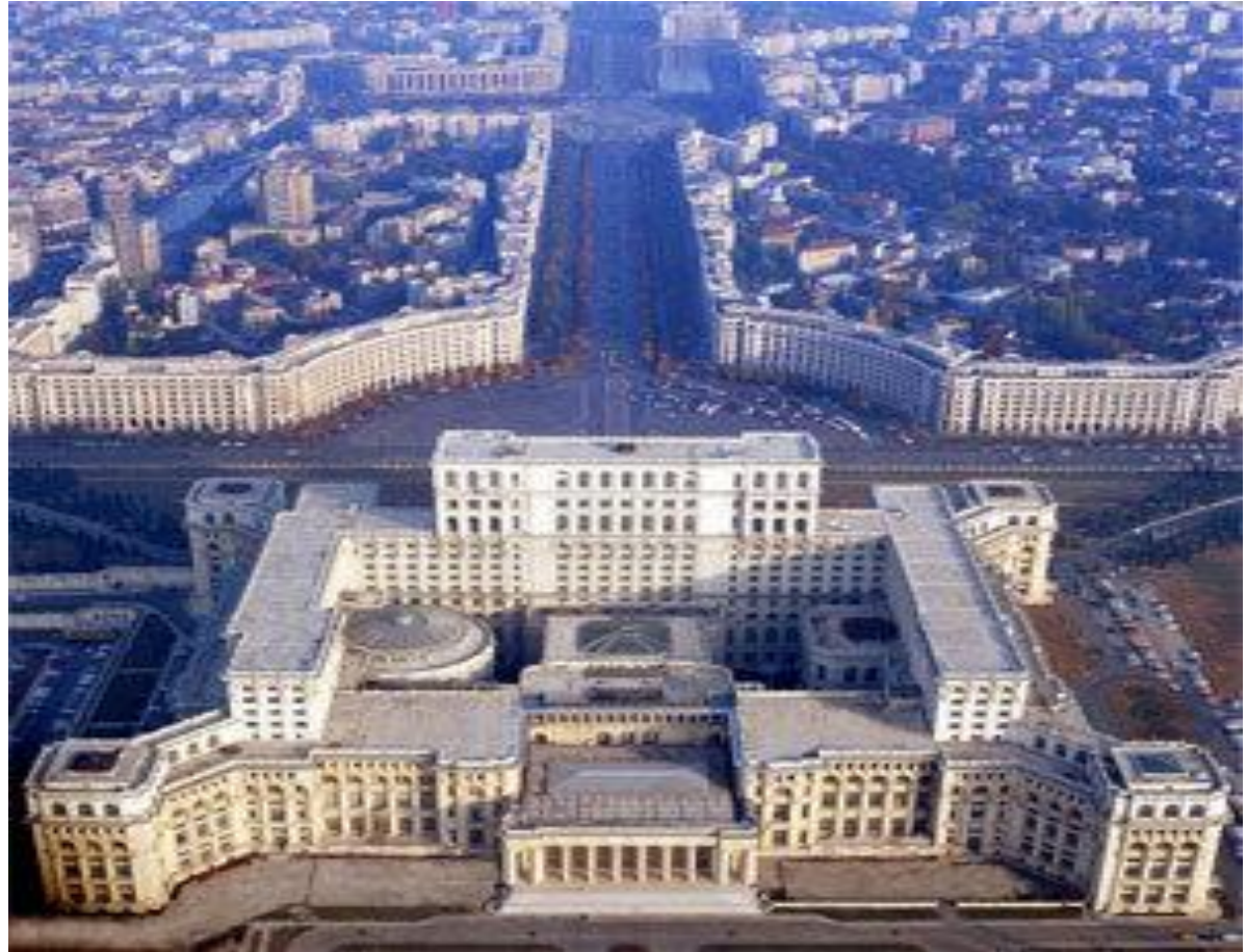
Palace of the Parliament, National Museum of Contemporary Art, Bucharest

✓ Tourism - business, congress & exhibition, spa & wellness, museums, gardens and parks